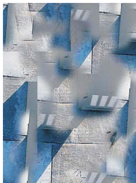
Archival Digital Prints