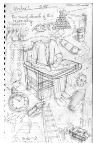
Unfinished Works and Studies